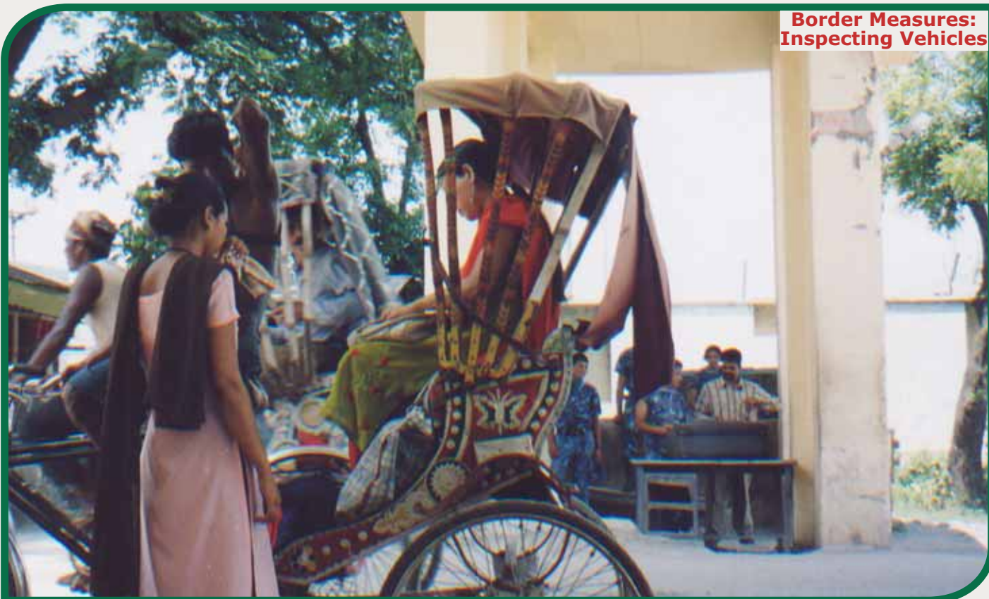
Border Measures: Inspecting Vehicles

Preventative activities carried out by Transit home holds great importance in Maiti Nepal's campaign. Activities like Interception, rescue, counseling, dealing with cases of missing, rape, domestic violence carried out by transit contribute to the preventative initiatives of the organization